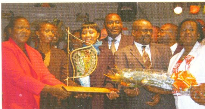
Brookside Dairies team poses with the Supplies Chain Management Award during the COYA gala night, 2007

but then the harder it is to manipulate those resources. At the end of the day, COYA assessments look into how these resources are managed in: big, medium and small companies. The assessment parameters for all companies in the manufacturing and service sectors are